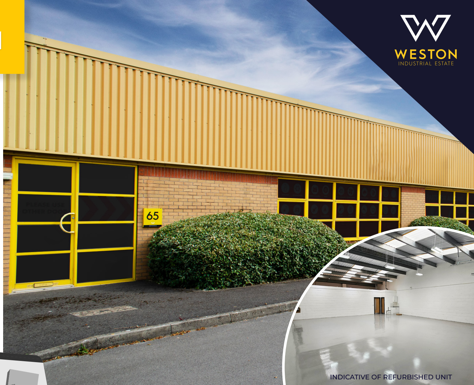
INDICATIVE OF REFURBISHED UNIT