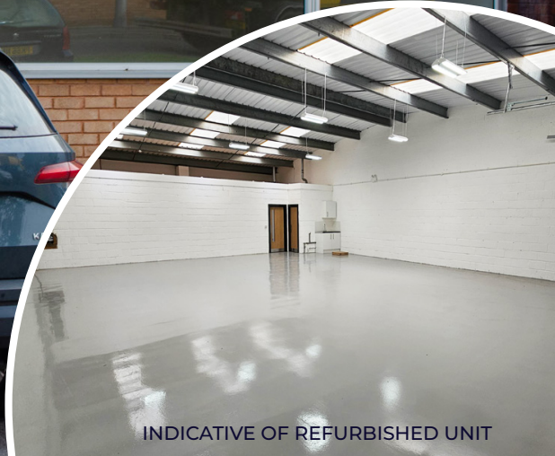
INDICATIVE OF REFURBISHED UNIT