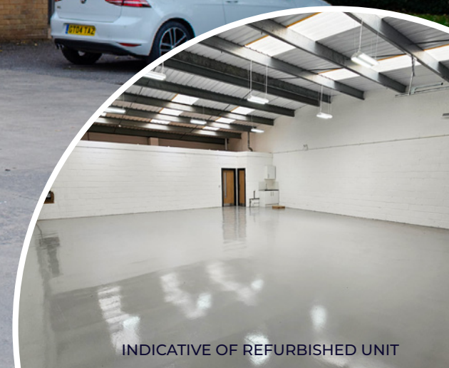
INDICATIVE OF REFURBISHED UNIT