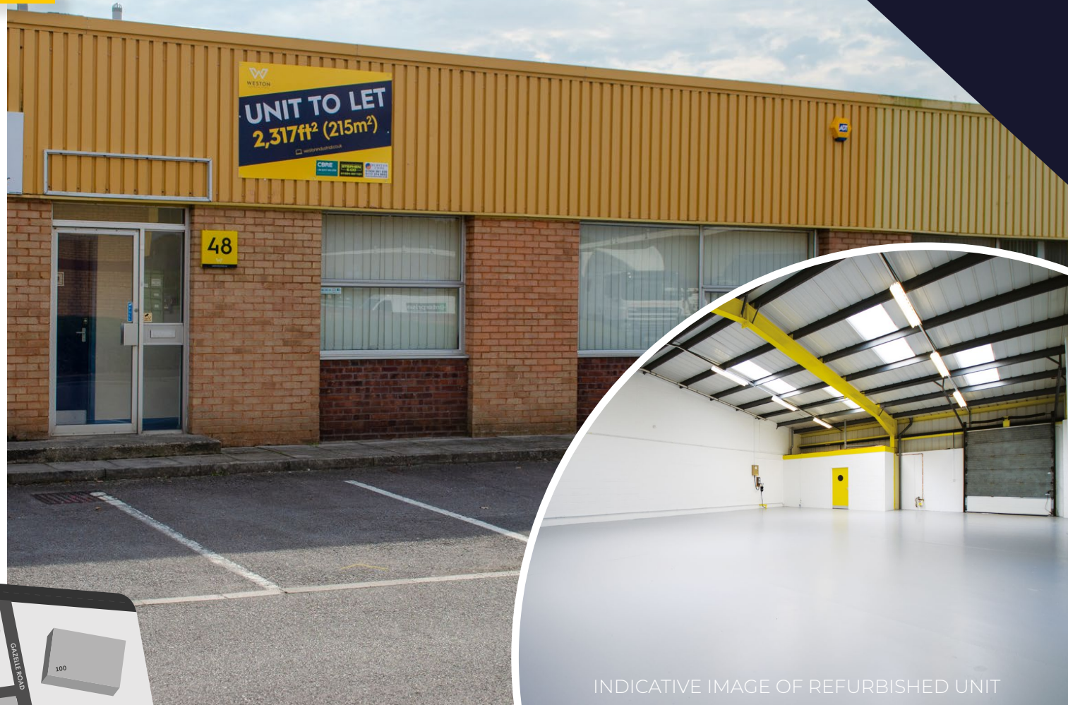
INDICATIVE IMAGE OF REFURBISHED UNIT